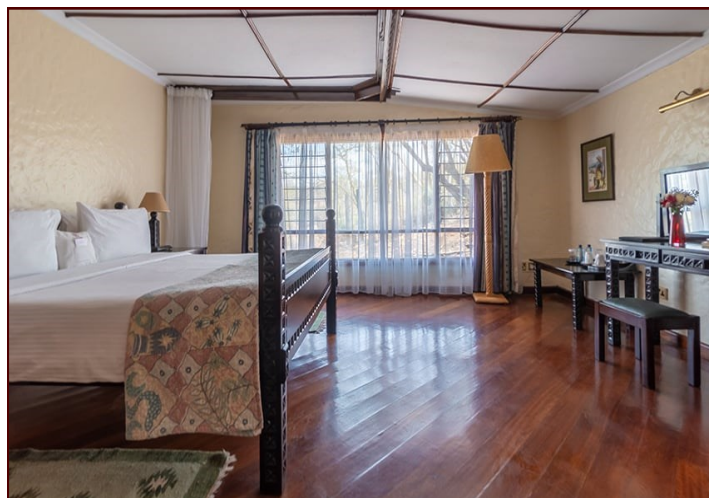
Sarova Lion Hill

substantial numbers of other species, including waterbuck, reedbuck and gazelle. Leopards are also to be found here, and the chances of sighting one are significant. Return to the lodge and take some time out for lunch, then head back out for another afternoon game drive. Keep your eyes peeled for one of Africa's most endangered creatures, the elusive black rhinoceros. While white rhino sightings are fairly common, spotting a black rhinoceros is a real treat.