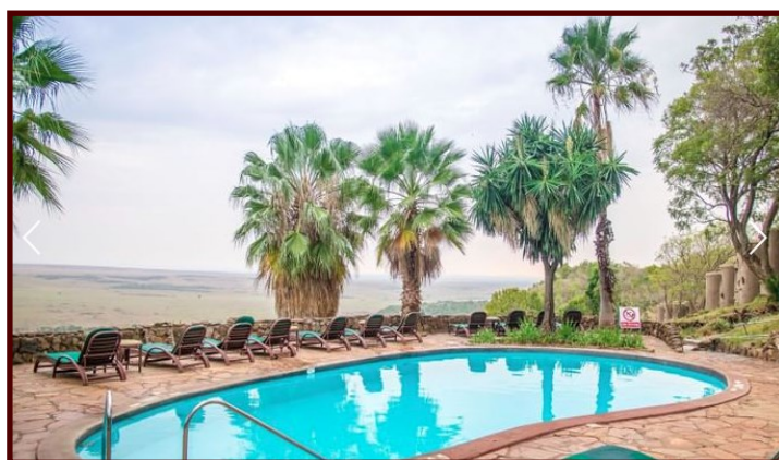
Mara Serena Safari Lodge

The morning is yours to do as you wish. You may like to sit back with a cup of coffee on your private deck, keeping an eye out for animals in the reserve, or forgo a sleep-in in favour of an early morning game drive or walking safari. If you'd like to see the Masai Mara from a different perspective, an optional sunrise hot air balloon ride is a truly memorable experience. Balloon rides can be booked ahead of time or on the ground (subject to availability) and the suppliers are committed conservationists, with a portion of the profits