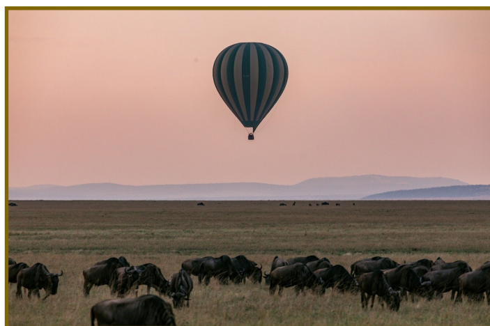
Optional Hot Air Balloon Experience ($525pp)

Explore more of the park by 4x4 today with further game drives in the morning and afternoon. Witness the wonderful procession of wildlife that inhabits the area. Wildebeest, zebra and gazelle are plentiful, and you might even spot predators keeping a casual eye on their movements. Elephants, giraffes and elands are also commonly sighted, along with plenty of bird life. The area is known for its rolling green plains and riverine woodlands, and amongst the many species of game, a black-maned lion, leopard or cheetah might appear, with some luck. As the sun starts to set, stop and take a moment to soak it all in with a drink in hand – there's few better ways to wrap up a day of wildlife spotting in one of the world's most magical places. As dusk falls, a variety of animals might be visible in the vicinity of your camp also.