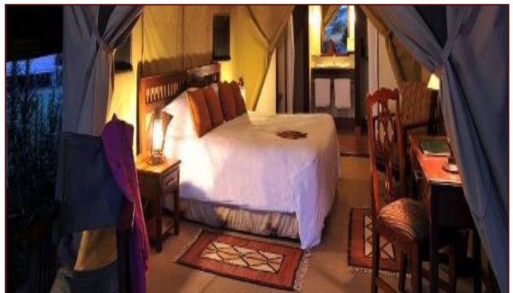
Sweetwaters Standard Tent