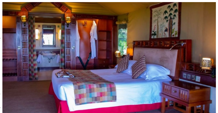
Sweetwaters Morani Tent