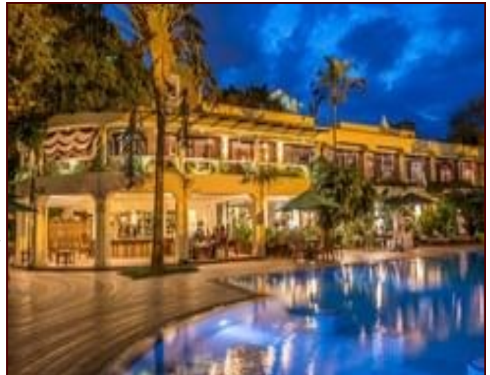
Nairobi Serena Hotel

Overnight at Sweetwaters Serena Camp. Accommodation will be in a standard tent. Upgrade to a Morani tent is possible on a limited basis. Cost is $190 per person double and $380 per person single.